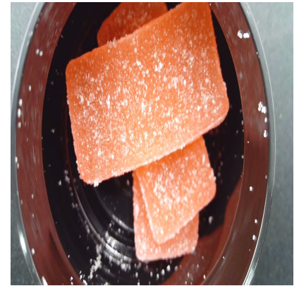
SERVING MASS (g): 9.24 SERVINGS/UNIT: 1